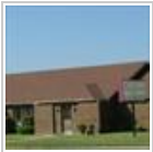
October 06, 2023 at 07:08 AM

“ 6 files added to the album Memories Album