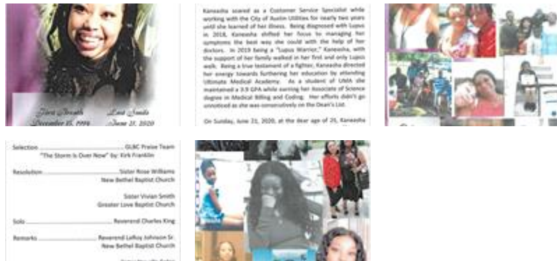
A Life Celebration by Franklin - October 05, 2020 at 12:19 PM

“ 6 files added to the album Memories Album