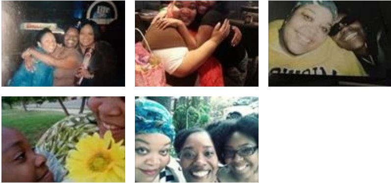
QuinnW - September 06, 2021 at 09:46 PM

“ Life as I know it will NOT ever be the same! I will ALWAYS remember your last few words to me! I AM SORRY, THANK YOU, & I LOVE YOU! Rest assured YOU owe me NOTHING I am beyond grateful and humble to know YOU BJC 507